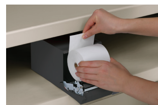
Front paper feeding with drop-in paper roll