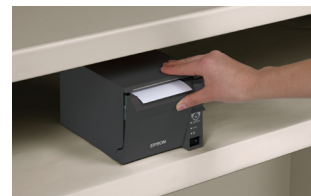
Front-facing operator controls

©2013 Epson Singapore Pte Ltd. All Rights Reserved. Reproduction in part or in whole, without the written permission from Epson, is strictly prohibited.